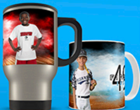
Travel Mug & Coffee Mug