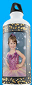
Aluminum Water Bottle